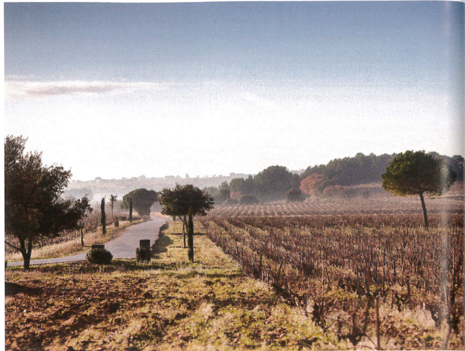
Above: the vineyards of Château de Beaucastel in Châteauneuf-du-Pape

Domaine de Marcoux, Vieilles Vignes 96 From 118-year-old vines in the lieux-dits of Esquières and Charbonnières. Sprightly, spicy and high-toned but fairly closed aromas. Bright red berry and plum fruit with a saline edge and juicy, ripe acidity that contributes to the sense of vivacity. Fine but generous tannins and a long, satisfying finish. Drink 2020-2027